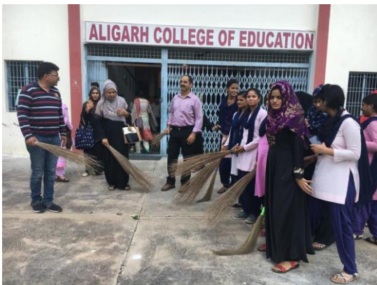
Swach Bharat Abhiyan